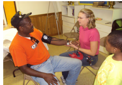
Health Fair at Washington Branch F.W.B. Church