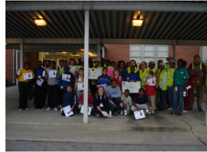
International Walk to School, West Greene Elementary