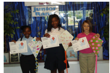
Asthma Awareness Day at West Greene Elementary