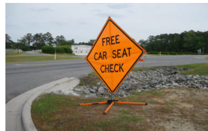
Car Seat Check-up Event